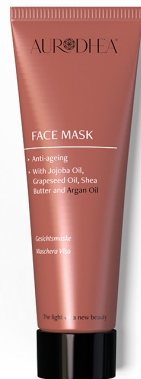
PHOTO OF THE PRODUCT