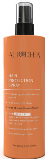
PHOTO OF THE PRODUCT